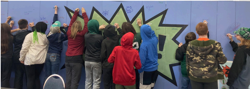
Students sign the ZWAP! Wall, committing to be Zero Waste Ambassadors

"WE HAVE BEEN TAKING OUR CLASS TO HOME RESOURCE AND DOING ZWAP! EDUCATION FOR YEARS NOW. IT WAS PARTICULARLY POIGNANT THIS YEAR BECAUSE OUR SCHOOL JUST IMPLEMENTED ZERO WASTE SCHOOL WIDE. OUR FIFTH GRADE LEADERS HAVE BEEN EXCELLENT AMBASSADORS." - TEACHER FROM JEANNETTE RANKIN ELEMENTARY.