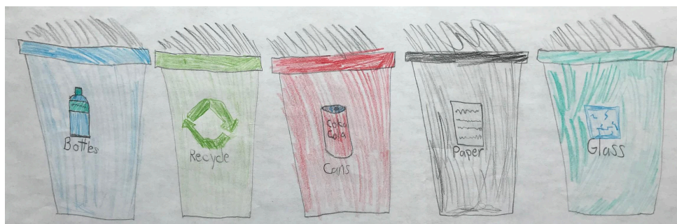
A student's visioning activity drawing about ways to become zero waste.

STUDENTS ARE "MAKING A RIPPLE EFFECT THROUGHOUT THE COMMUNITY"