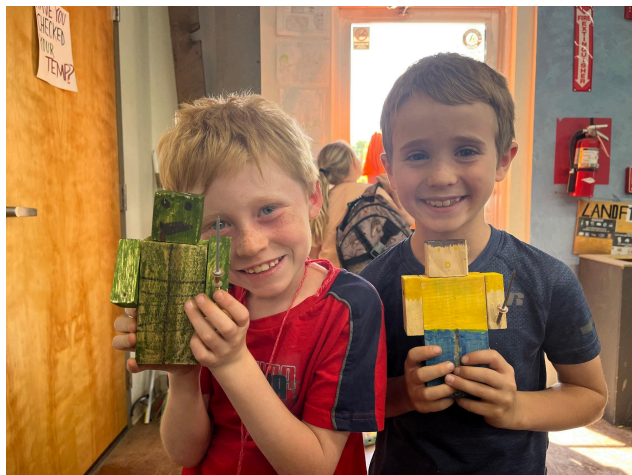
Students create ReUse Robots during a summer camp.

Program education continues for students in our community during the summer when we host summer camps for field trips. During the 2024 summer, we'll host 15 camp groups from Frenchtown, Missoula Parks and Recreation, Montana Natural History Center, YWCA GUTS, and Zootown Arts Community Center. During these programs, we continue exploring the ideas of zero waste through creative reuse projects made with supplies that students find throughout the store.