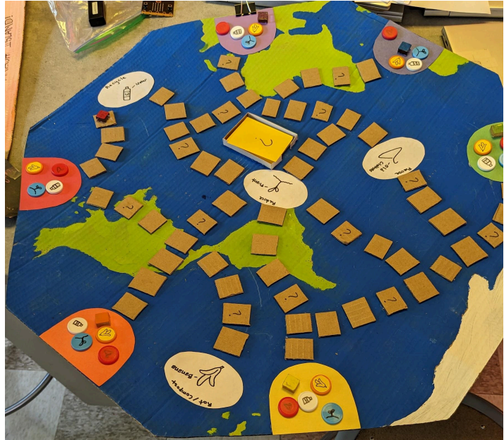
Board game created by 6th grade students at Washington Middle School for Home ReSource's ZWAP! Program

The success of the program has also allowed us to provide programming outside of the 5th grade curriculum. This year, we were the 'client' for a 6th grade Project Lead the Way classroom at Washington Middle School who created a board game for Home ReSource. We provided them with the problem: create a board game for elementary aged kids that is inspired by a zero waste world. Students in the class used their prior ZWAP! experience to create educational games, some of which were donated to Home ReSource to be able to use in our programming. These students cleverly took concepts they learned of zero waste practices and displayed them as physical pathways players can choose to navigate - those more efficient routes being shorter paths and those with less overall impact being longer - a helpful way to illustrate to younger students the benefits and consequences of our waste streams.