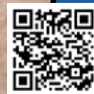
TABLE ON FIRE