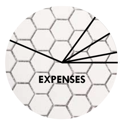
56% STORE 29% DECONSTRUCTION 6% EDUCATION 6% FUNDRAISING 3% ADMINISTRATION

96% OF WHICH WE RETURNED TO THE LOCAL ECONOMY